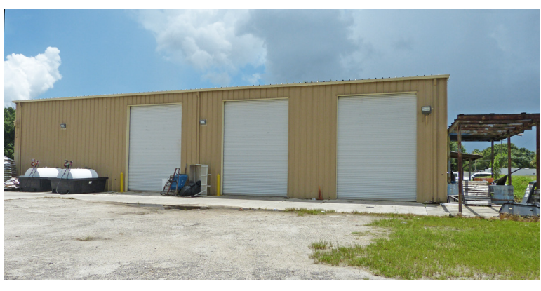
West Side: opposing doors allow drive-thru servicing. 2 Fuel Tanks: Gas & Diesel