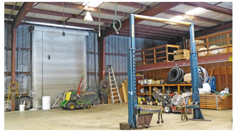
Heavy Duty Lift