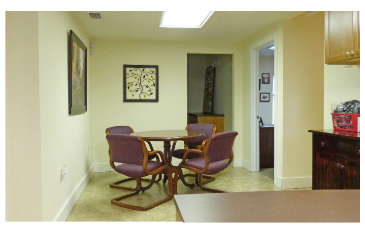
Reception Desk and Conference Area in same room