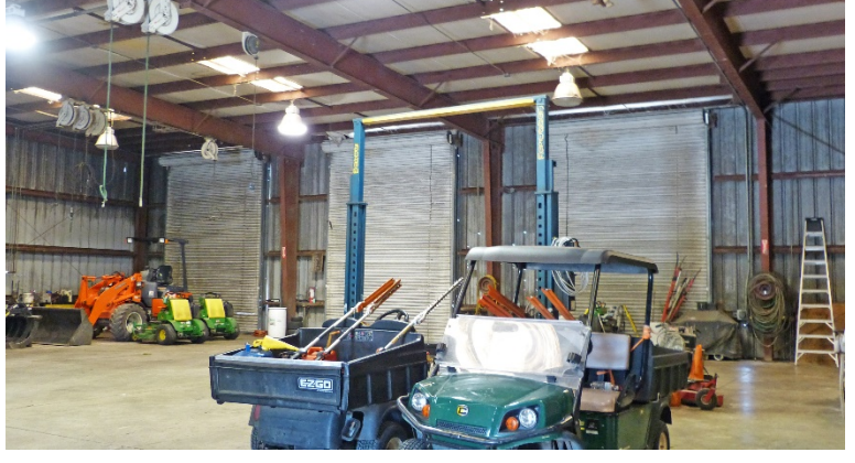
Overhead Compressed Air lines