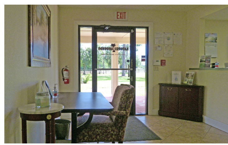
Front Entrance & Lobby