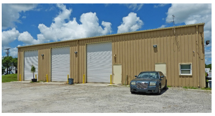
East Side of 5,5950sf Shop: Six 16' X 12' Roll Doors