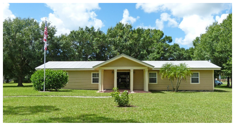
2,312sf Office Bldg: 5 Spacious Offices, Lobby, Reception, Conference, Gym, Kitchenette, 2 Restrooms, 3 Entrances