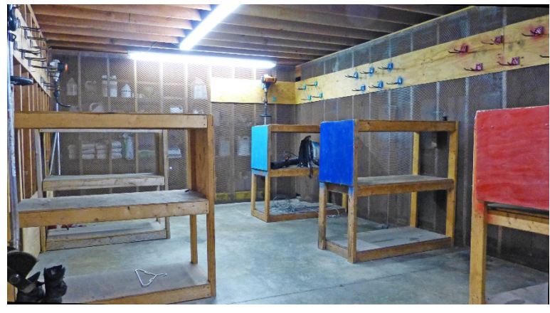
One of two Secure Tool Rooms