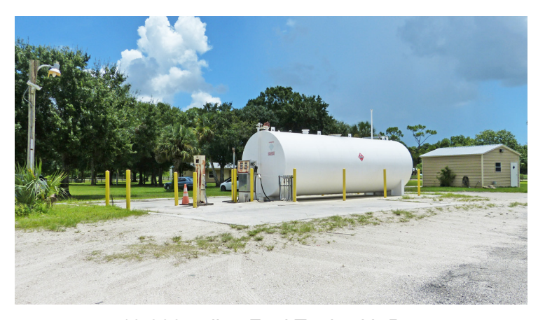
10,000 gallon Fuel Tank with Pump